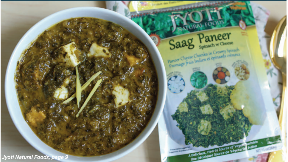
Jyoti Natural Foods, page 9