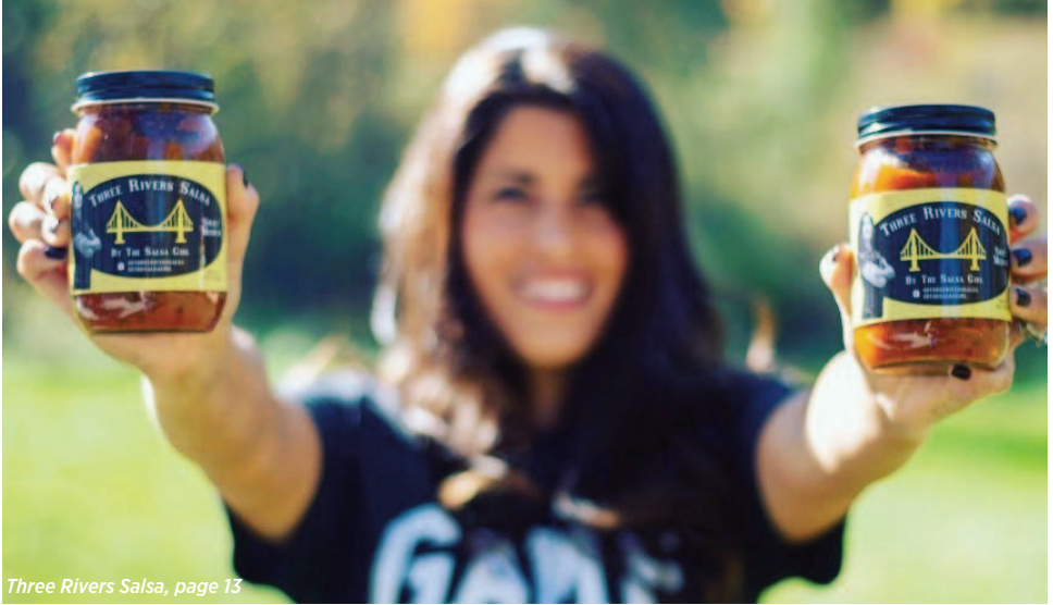
Three Rivers Salsa, page 13