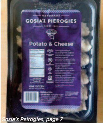
Gosia's Pierogies, page 7