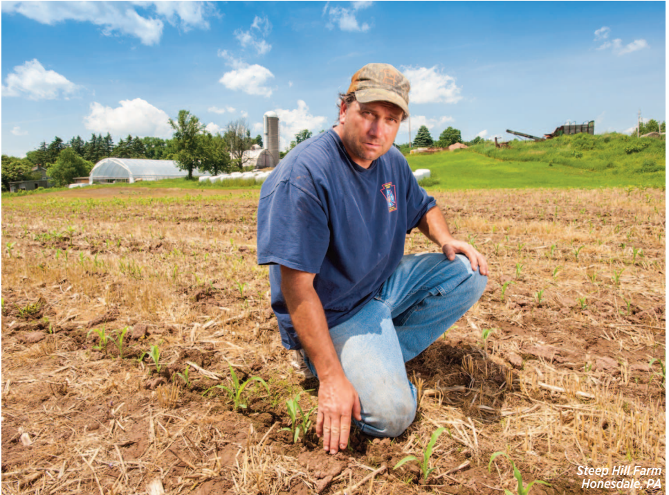
Steep Hill Farm Honesdale, PA