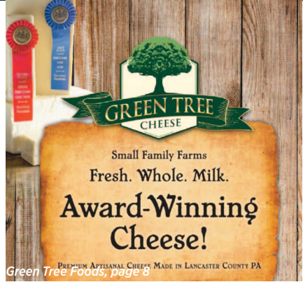
Green Tree Foods, page 8

Don't forget to visit our other Pennsylvania companies exhibiting throughout the show. Use the online Directory & Floor Plan at sff2023.mapyourshow.com to find product details and booth locations. Then, visit and experience all the amazing products PA has to offer!